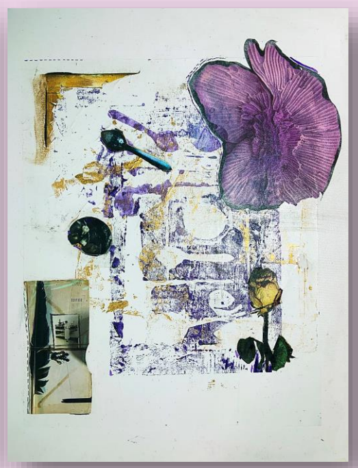
FAMILY TREE. Installation of collagraph, collage, assemblage.