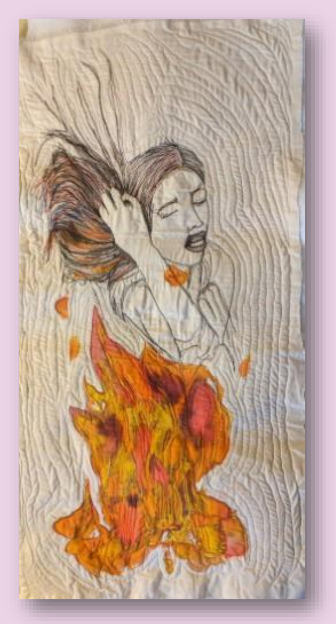
SHE WILL BURN EVERYTHING Quilted Textile. 34 x 24 inches

During the demonstrations against the repressive Iranian government last year, many women demonstrators unveiled their heads and burned their hijabs as protests for the actions of the police against women who rebelled against the restrictive and violent action of the morality police which resulted in many deaths. Since then, men and women have relentlessly continued their protests led by these valiant women who have cut their hair, burned their veils and run in the streets shouting for their freedom.