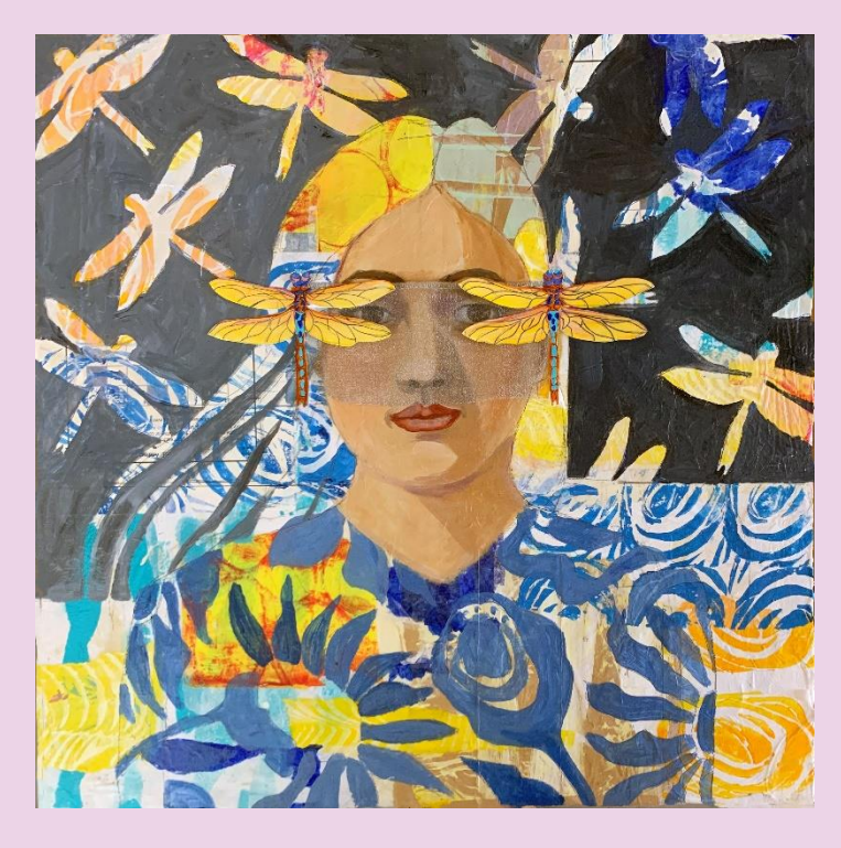
LOOKING THROUGH THE VEIL OF LIES. Mix Media, 18 x 18 inches.

The temptress who wears her headdress wrong, the older women seen as a hag that hides in the forest and eats children, the witch that must be burned at the stake, the young helpless frail maiden that must be safe from evil by her prince charming, the evil stepmothers in competition with her stepdaughter for who is more beautiful; are a few examples of the way women are depicted in fairytales.