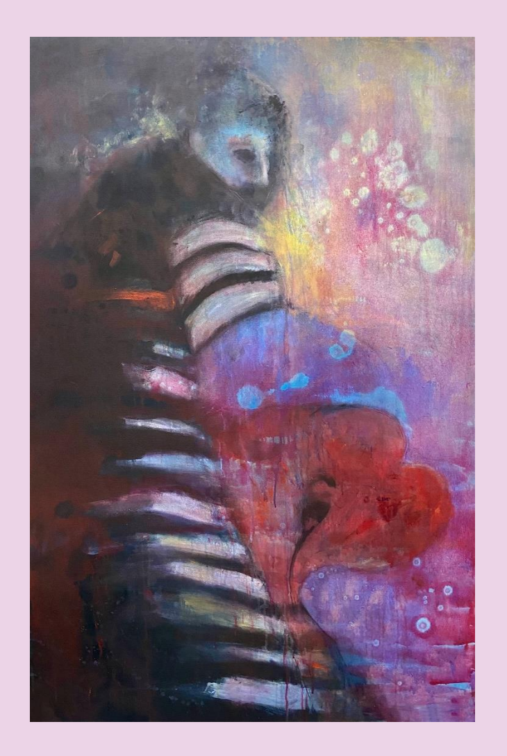
THE SCREAM. Mix media on canvas. 60 x 40 inches.

"I raise my voice not so that I can shout, but so that those without voice can be heard."