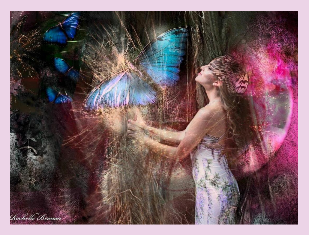
RELEASE. Digital Photography. 26 x 36 inches

As a Fine Art Photographer, I love to experiment into new avenues of visual expression. I utilize photo layering and collage techniques to create my "Dreamscapes". My inspiration comes from extensive world travel as well as natural environments; especially the ocean, beach and mountains.