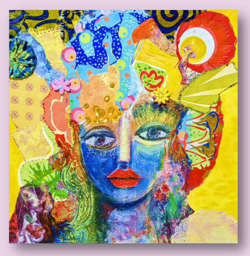
GIALLO, Mix media on canvas, 20 x 20 inches.

Spirituality was added to physical attributions. Then the sacred woman is born: the Goddess, the Saint, the Virgin, Mother Nature...The intellect of women, on the other hand, has remained in the shadows.