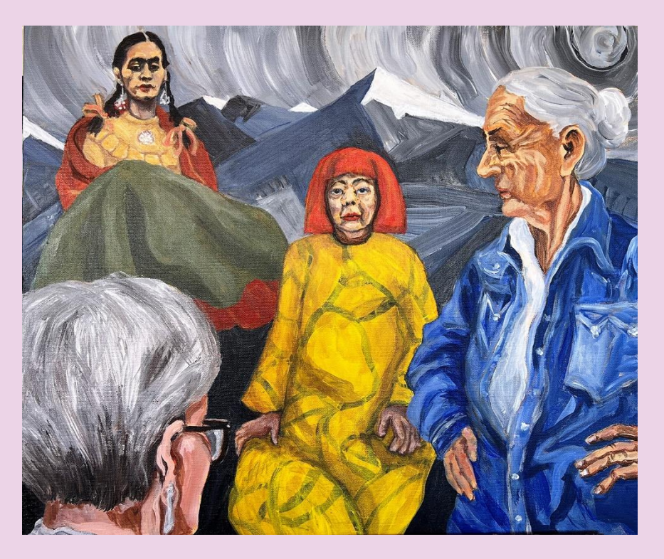
THROUGH THE EYES. Acrylic on canvas. 20 x 24 inches

For my segment of this art show I have selected women that have impressed me because of their deep rooted strength. At the start of my process, I followed my intuition and the immediate feeling that each of their images produced.