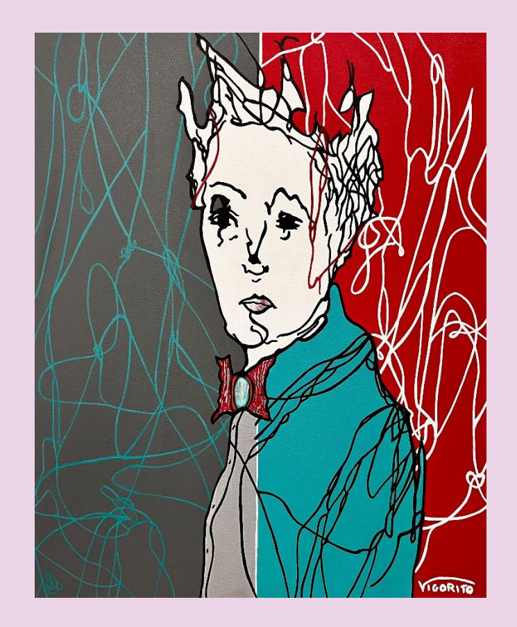
UN TIPO. Acrylic on Canvas. 30 x 24 Inches.

I perceive my artist role as that of a messenger, philosopher, outlier and empath. My unique and noticeable style involves mosaic style fragmentation, raw emotive lines and vibrant colors, combined to explore various themes, such as the female form, portraiture, androgyny and the inner psyche.